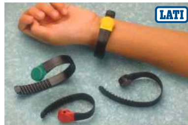
Arm or leg electrode (for electrocardiogram) in LASULF