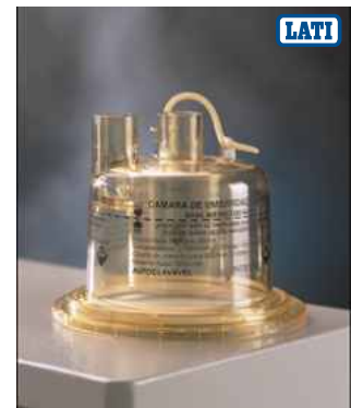
Humidifying chamber in LASULF

Note: should you be interested in receiving a more detailed brochure, just contact our Offices